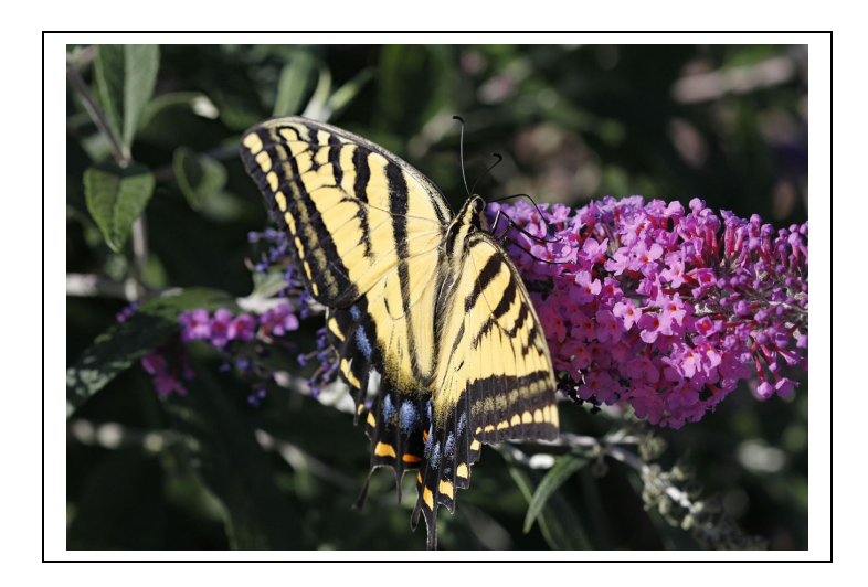
Tiger Swallowtail

Regarding the butterflies this year, the big attraction is the appearance of two tailed Tiger Swallowtails flitting all over the yard and actually in the town too. I have included a spectacular picture taken by Hari with his new camera and lens. The flower is the Buddleia the butterfly is feeding on.